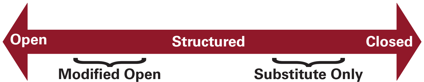
Figure 2. Spectrum of rules. This figure represents the potential spectrum of rules for consideration of House and Senate bills, resolutions or amendments between the Houses in the House. Rules which are most open to amendment are on the left, while rules which essentially prohibit amendments are on the right.

» MIRV: The acronym for “multiple-impact reentry vehicles” (an 80’s era type of nuclear warhead) refers to a rule which makes in order multiple bills and after passage of each, puts all of the bills together in one legislative vehicle.